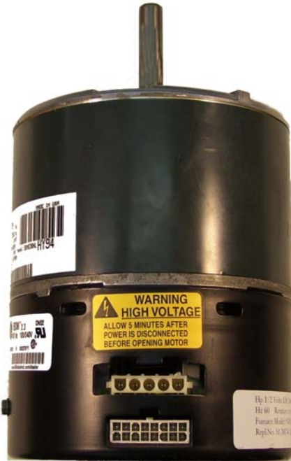
For ECM Motors

Quickly Tests Incoming Line/Harness Power for ECM Motors by G.E. and Regal-Beloit